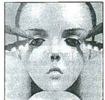
"Dallies With Innocence"

&Advertising and other cultural forces have trained entire generations to pigeon-hole definitions of beauty and body image and in many cases beauty is defined by a very narrow standard. I believe that women are extremely complex and that their beauty cannot be defined by perfect white teeth or other perfections. I hope my paintings inspire viewers to explore the social messages and values about beauty and the environment. It is